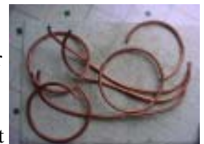
18.6 inches of copper cut from wort chiller

Total cost of repair was about $20, which is better than $60 for a new chiller. I will probably have to continually check to make sure the joints remain tight before and after each use.